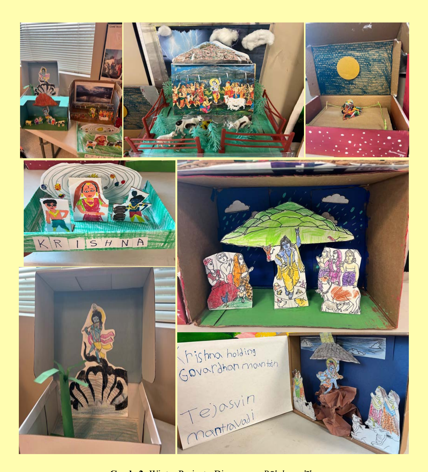
Grade 2: Winter Project - Diorama on Bālakṛṣṇalīla