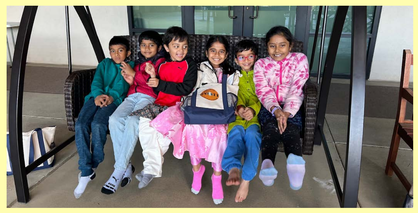
Grade 2: Children enjoying during Mahāśivarātrī rehearsal.