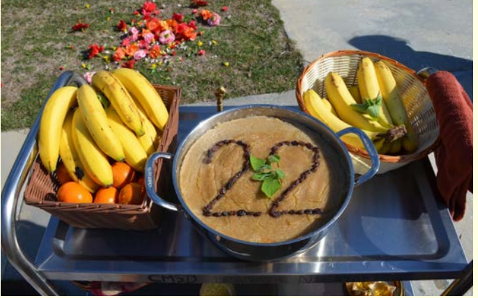
All CMSD members walked towards the front of the \bar{a}\dot{s}rama to partake in S\bar{u}ryan\bar{a}r\bar{a}yana Astottara chanting and S\bar{u}rya p\bar{u}j\bar{a} .