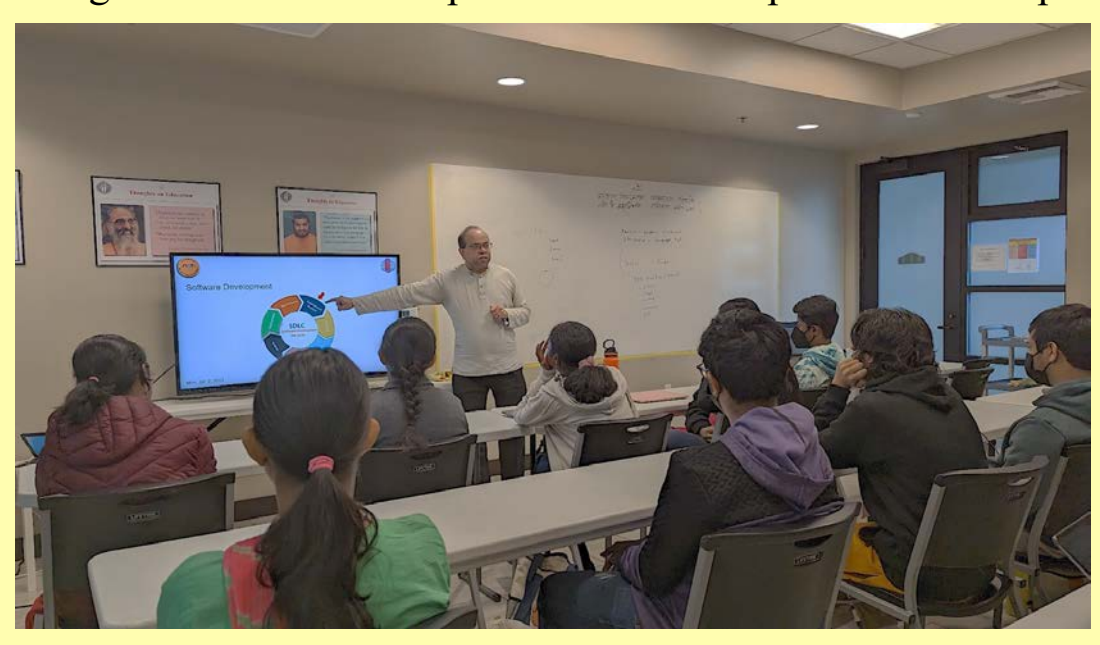
January 2, 2023, CMSD High School Mentorship Program