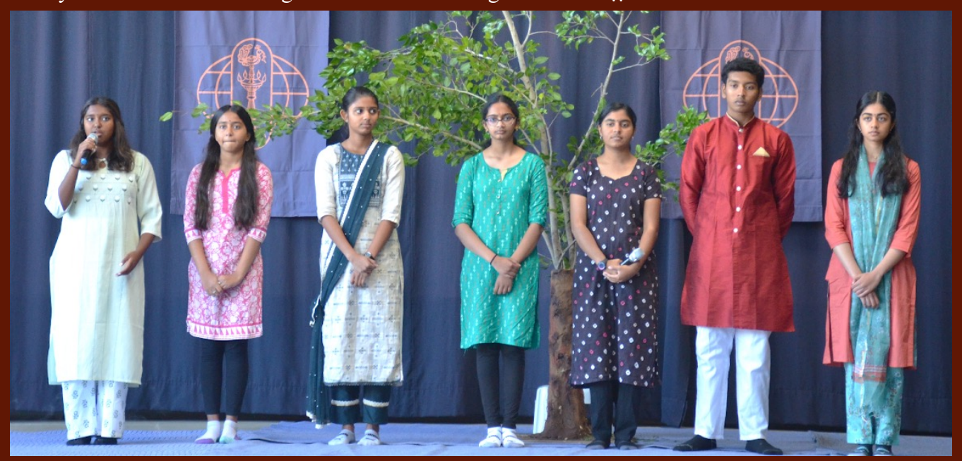
Thereafter, Grade 9 presented the special legends and significance behind Śivarātrī celebrations.

On the following Sunday, February 19, 2023 , the students of Bala Vihar Grade 2 presented the story of the hunter and the tiger and led the chanting of the Bilvāṣṭakam .