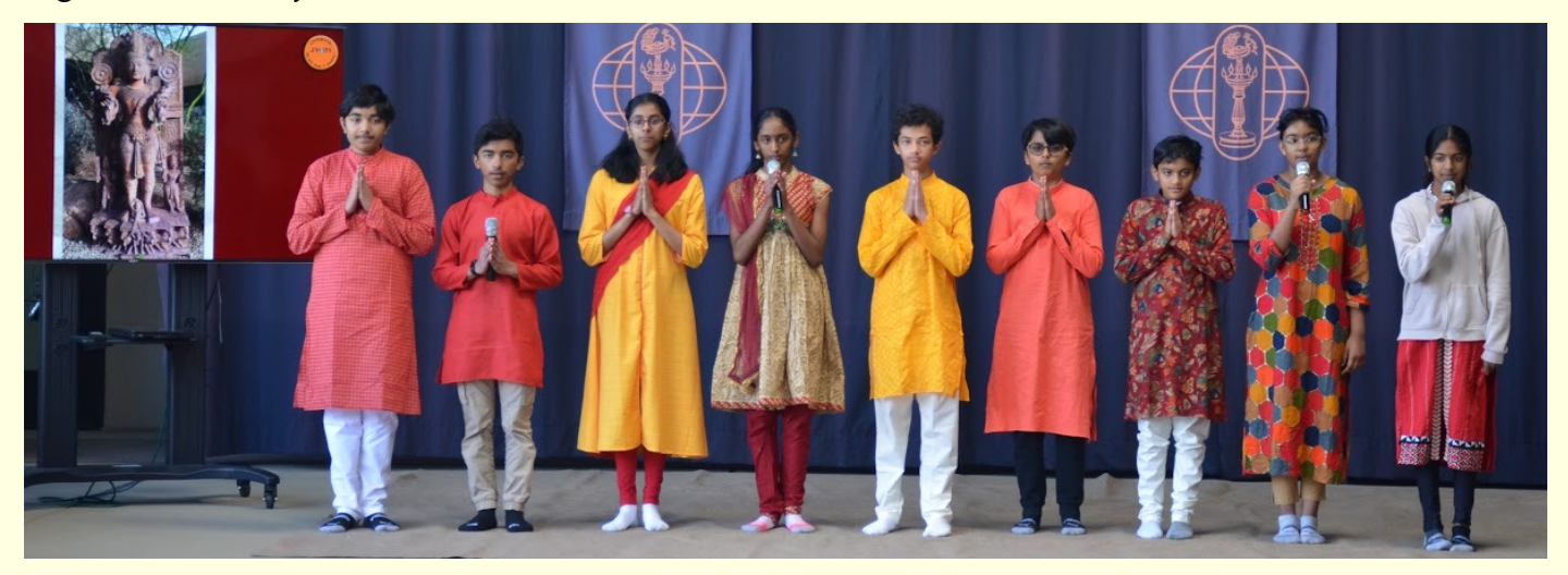
CMSD families, along with Grade 7 children, recited the sacred hymn "Āditya Hṛdayam", which is known to bless the upāsaka with longevity, health, wealth, removing worries and defeating enemies.