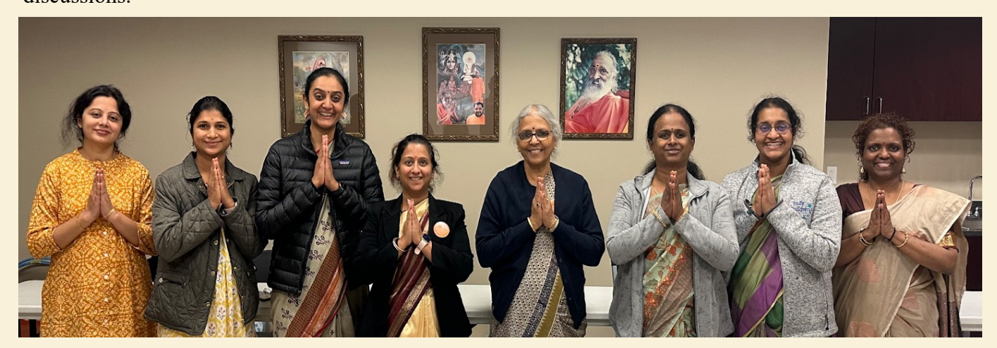
The February 12, 2023 meeting strengthened the discussions of the previous session with a focus on: "Practicing Hinduism with Pride".

On January 15, 2023, the first session of Samskṛti Pālakās was conducted with a focus on "Values are Caught and Not Taught" and "Sustainable Living." The discussion this month was directed to the quintessence of how the daily living structure within a family creates a strong value system that is easily absorbed by our children. Mothers, being the focal point of the family, must incorporate sustainability into everyday living which eventually results in the upbringing of "Responsible Global Citizens". The essence of "Think Globally Act Locally" was beautifully brought about in the discussions.