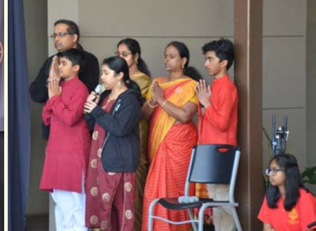
A few mantras from the Sūrya Upaniṣat from Atharva Veda, and Cakṣuṣopaniṣad were also recited.