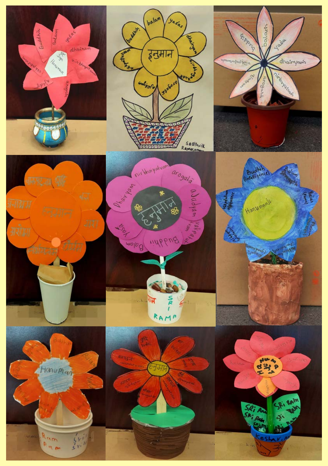
Grade 4: Pot of Devotion fertilized with Knowledge , blossoms the flower of Hanumānji bejeweled with gems of intelligence, strength, courage, fearlessness, freedom from disease, freedom from fatigue, eloquence and fame