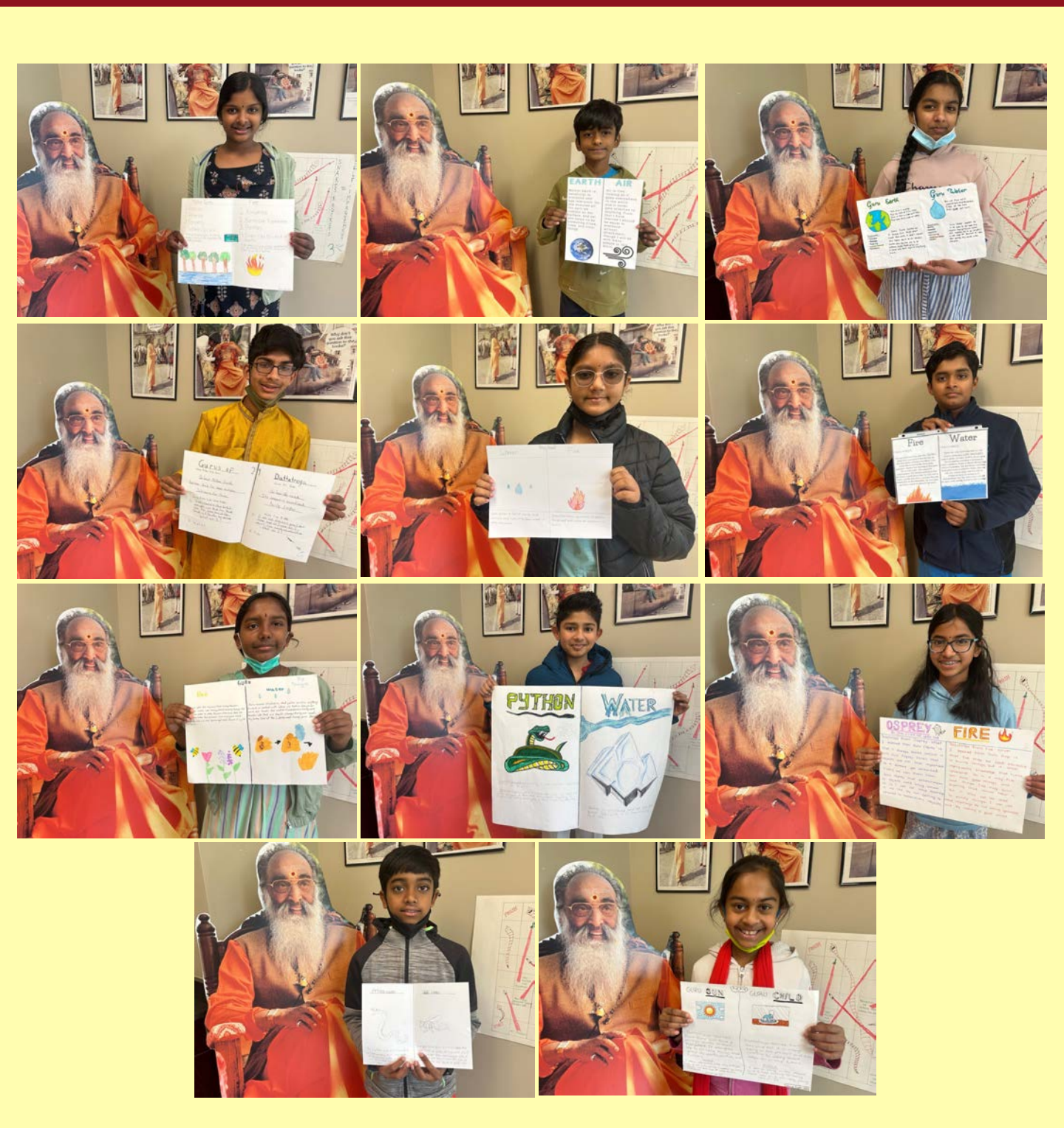
Grade 6: Winter Break Poster Project - 24 Gurus from Avadhūta Gītā