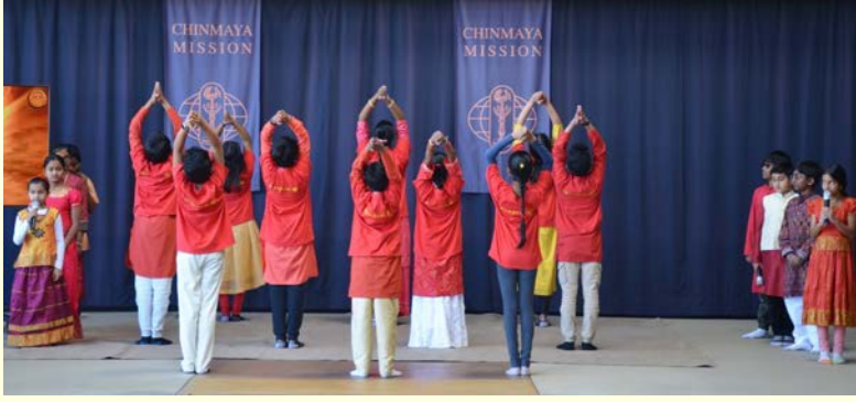
The little SV and BV children lovingly sang a song welcoming the rising sun - "The sun will rise, the birds will chirp.." The elementary and middle school students offered Sūrya Namaskāra while chanting a sun salutation for each of the twelve postures. The audience also joined in to perform this ancient practice.