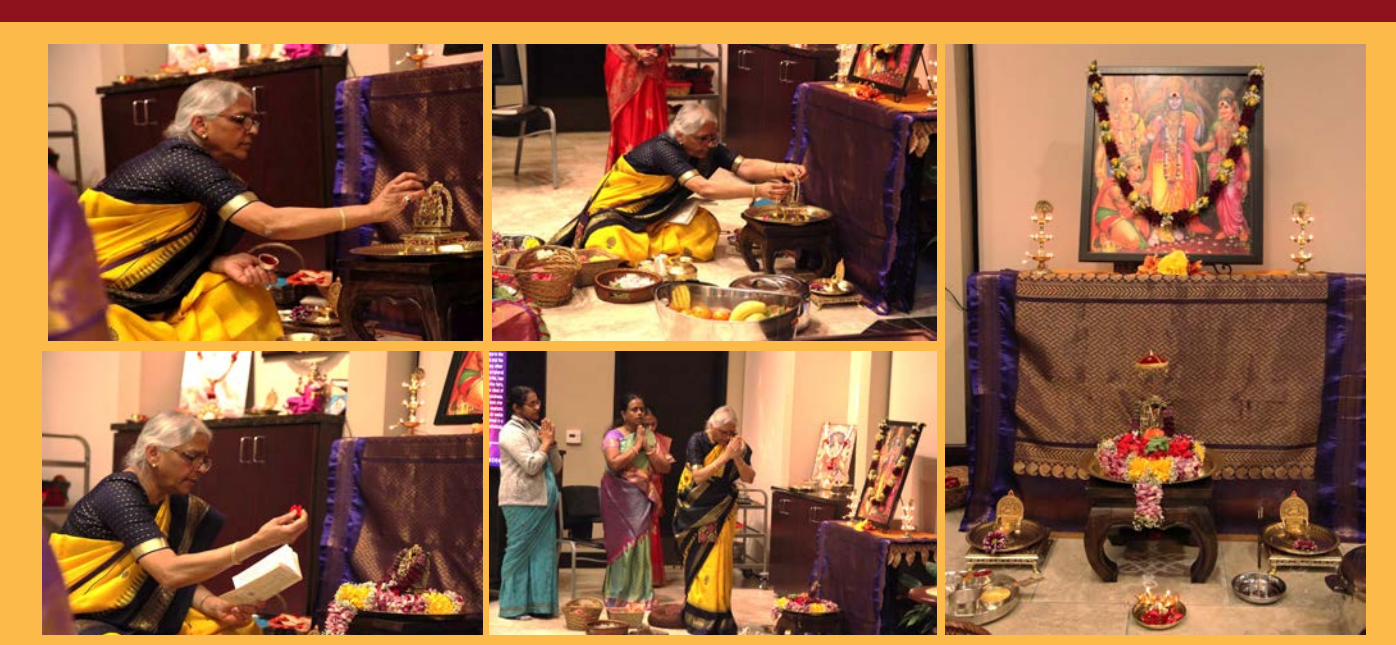
Śrī Rāmanavami, celebrated on March 30, 2023, was a perfect tribute to the study of Vālmīki Rāmāyaṇa.