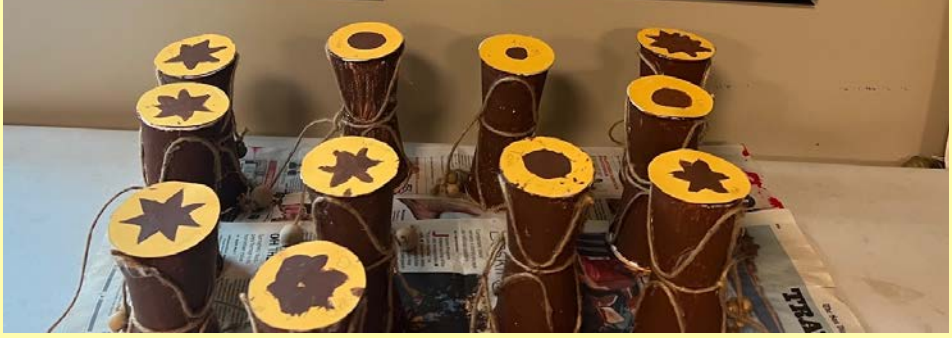
Grade 2: Damaru project - Mahāśivarātrī