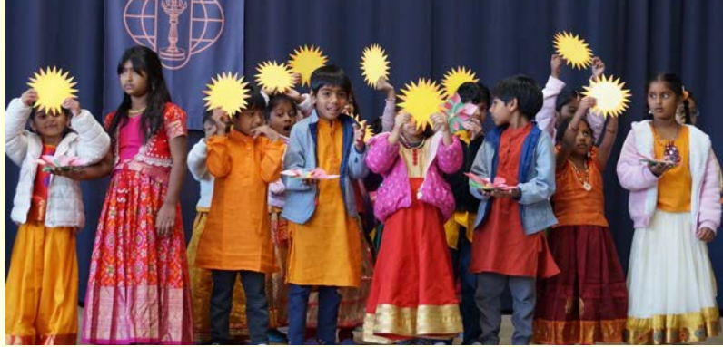
Aunty mentioned that performing charitable acts on Solar Eclipse days is considered very auspicious and so also on Rathasaptam\bar{\iota} . The 22^{nd} Anniversary Program concluded with CMSD's youngest children displaying S\bar{u}rya and Lotus craft; celebrating the occasion.