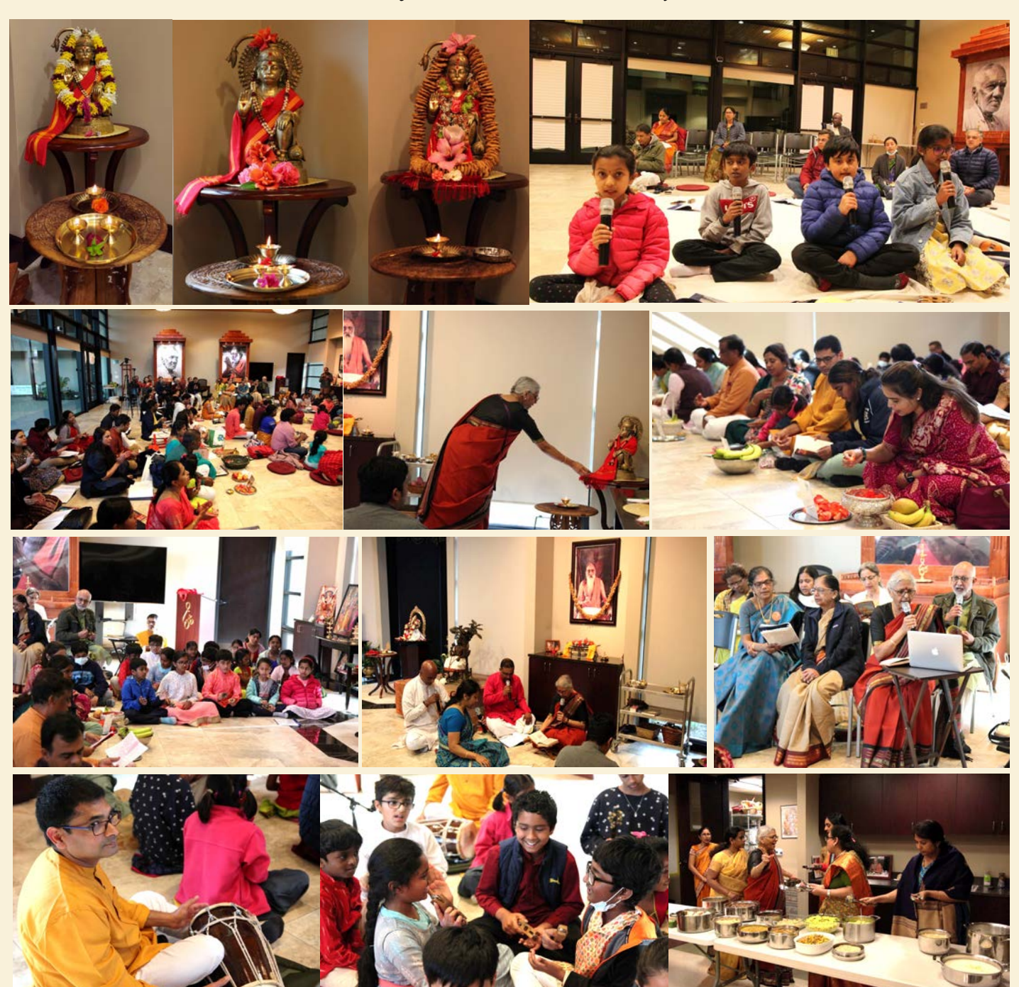
On March 25, 2023 , CMSD celebrated a remarkable milestone of completing fifteen years of monthly Sundarakānḍa Pārāyaṇā with fifteen yajamān -s.