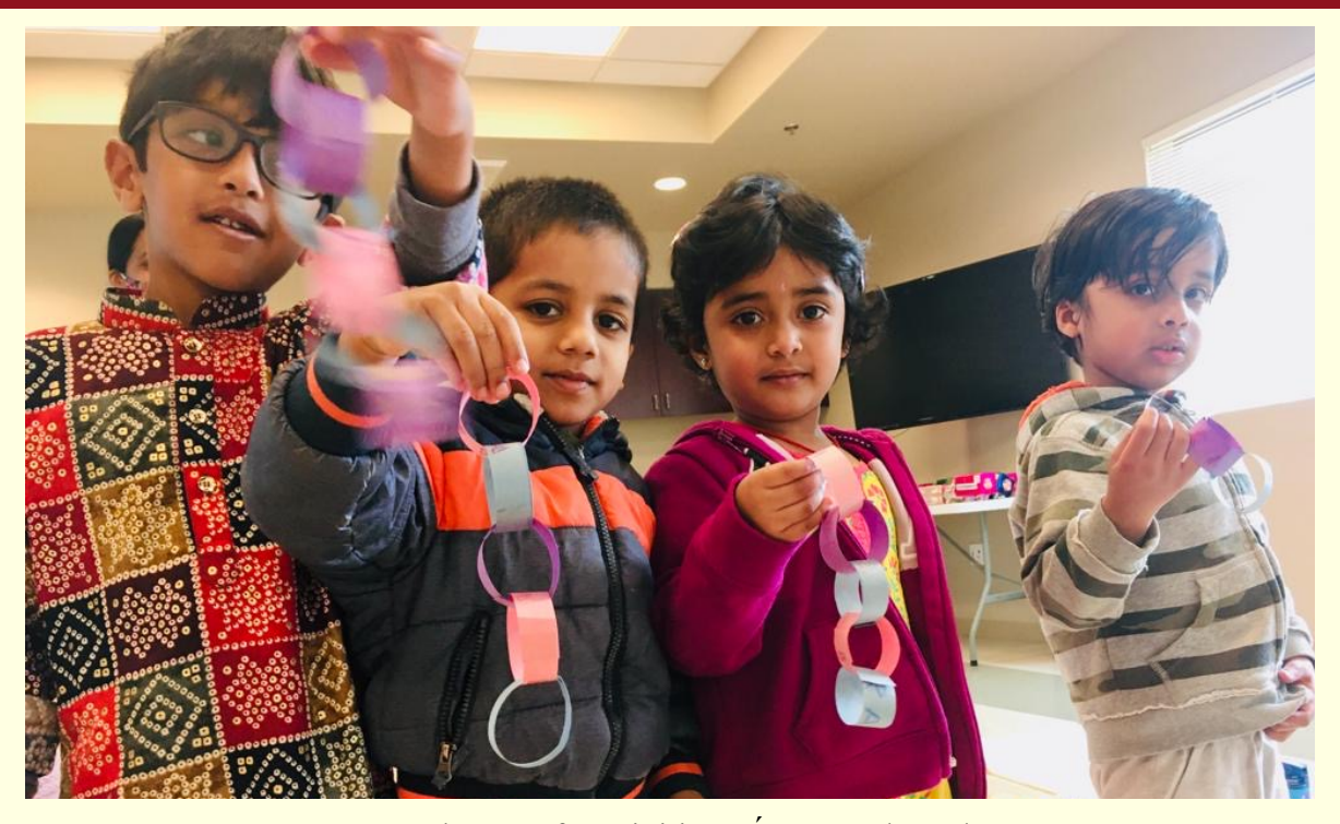
SV3: Class Craft Activities - Śrī Rāma bracelet