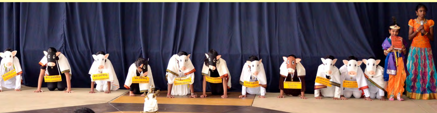
sarvopaniṣado gāvo dogdhā gopālanandanaḥ

Our Pujya Gurudev's words echoed in our minds as we all witnessed the unfoldment of the Gītā Mahotsav on December 8, 2019. CMSD Gītā Mahotsav was a magnificent way of celebrating Gītā Jayanti - a perfect homage to our Pujya Parama Gurdev Tapovana Maharaj on his Jayanti day.