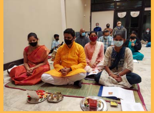
December 18, 2021