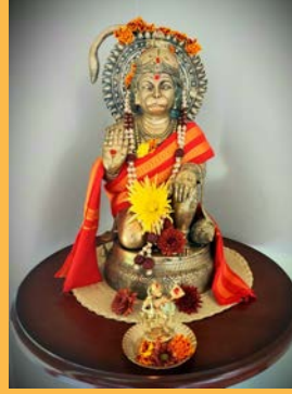
November 20, 2021