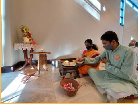
October 23, 2021