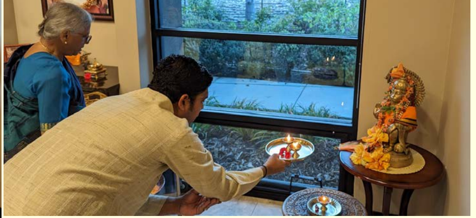
November 18, 2023