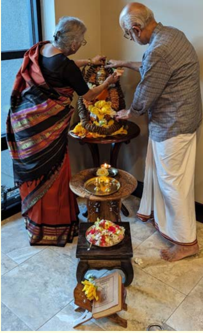
October 21, 2023