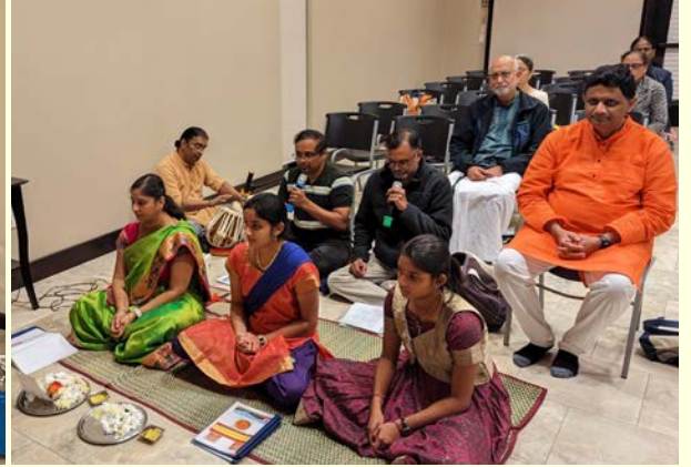
December 16, 2023