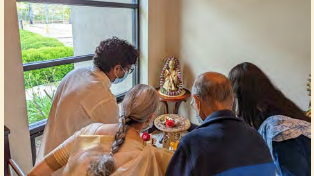
May 28, 2022