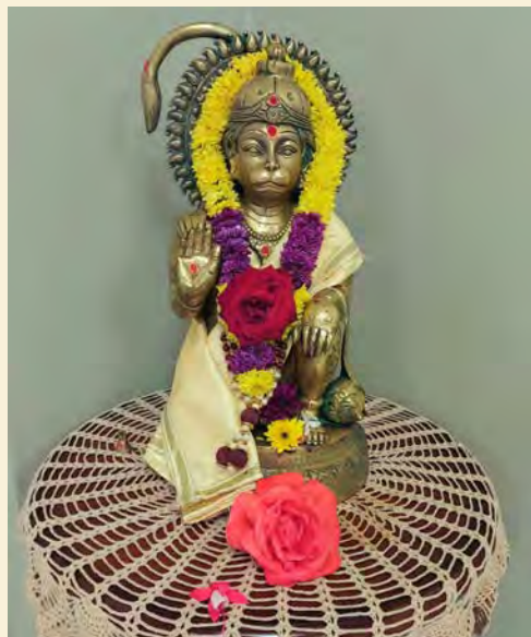
June 18, 2022