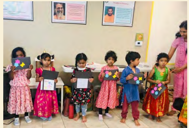
SV3 - Creating cards for Gurudev's Birthday