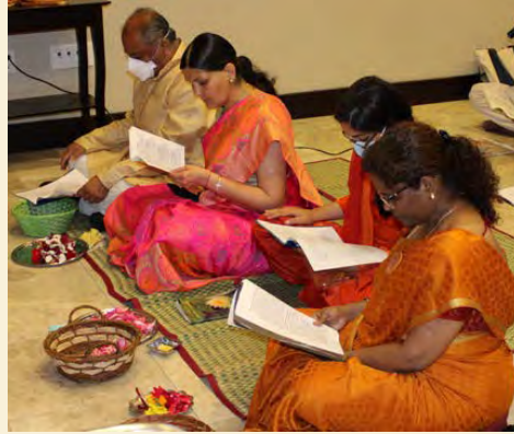
April 16, 2022