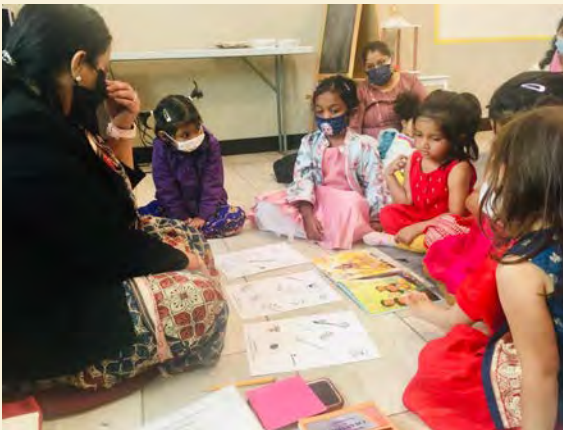
SV3 - Topic of the day