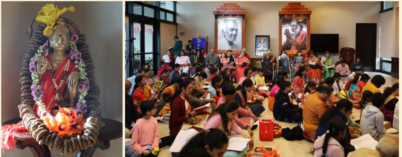
March 23, 2024