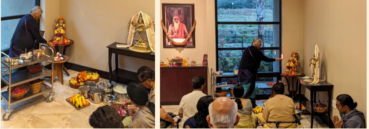
January 20, 2024