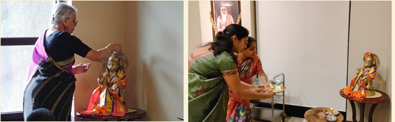
February 17, 2024