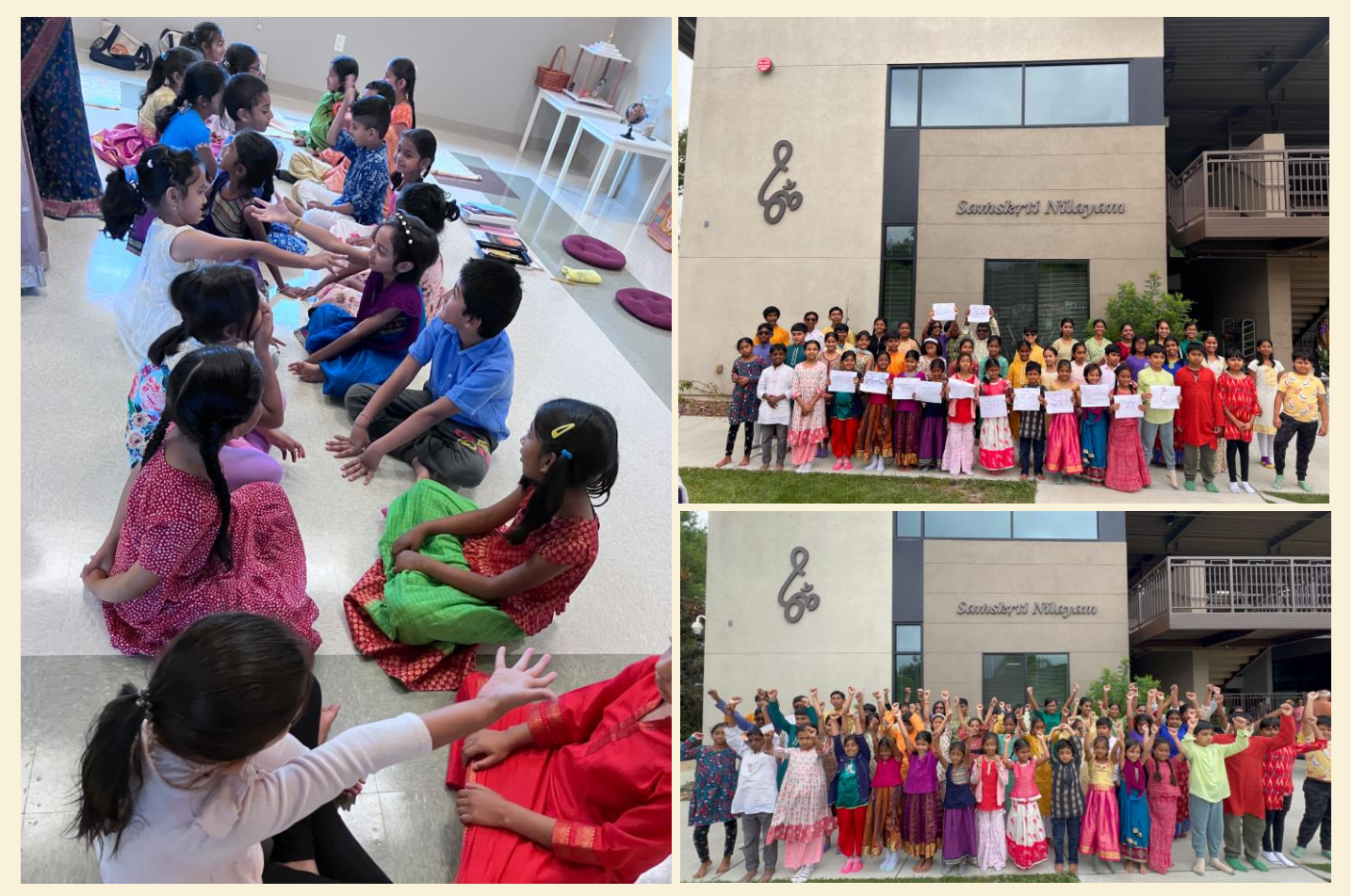
Hindi Diwas 2024