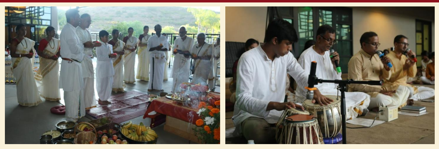
Chinmaya Swaranjali offered various compositions and bhajans in honor of Pujya Gurudev.

The highlight of the event was a profound vedic chanting from Taittirīya Upaniṣad , offered as an upacāra by the CMSD Vedic chanting group on this auspicious occasion.